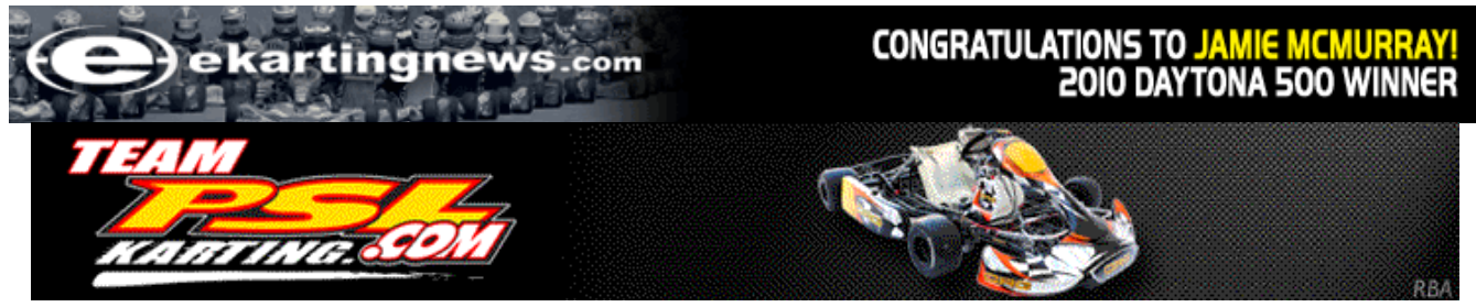
HOME - NEWS - FEATURES - DRIVERS - PR WIRE - FORUMS - MULTIMEDIA - PHOTOS - SCHEDULES - RESULTS - LINKS - INTERNATIONAL NEWS